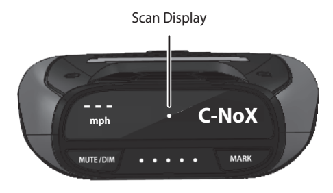
Elements on the screen vary according to what you turn on and off in the Menu system

A small dot on the screen indicates that the unit is scanning for signals . This dot travels back and forth in the middle of the screen. You can turn this display on and off in the Menu system.