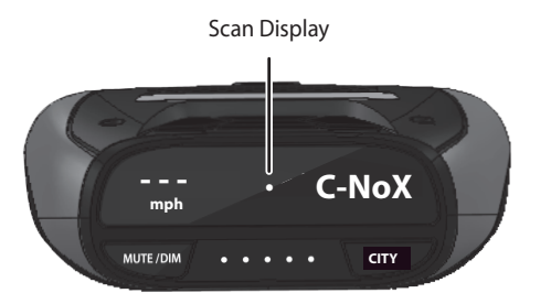
Elements on the screen vary according to what you turn on and off in the Menu system

A small dot on the screen indicates that the unit is scanning for signals . This dot travels back and forth in the middle of the screen. You can turn this display on and off in the Menu system.